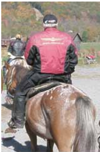
Funniest Looking Goldwing We Ever Saw