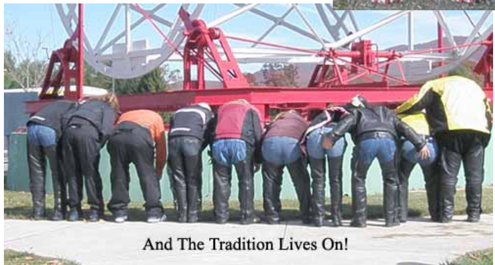
And The Tradition Lives On!